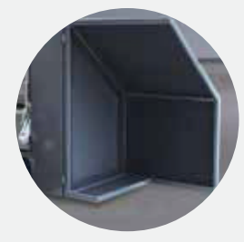
Sound Proof Enclosure